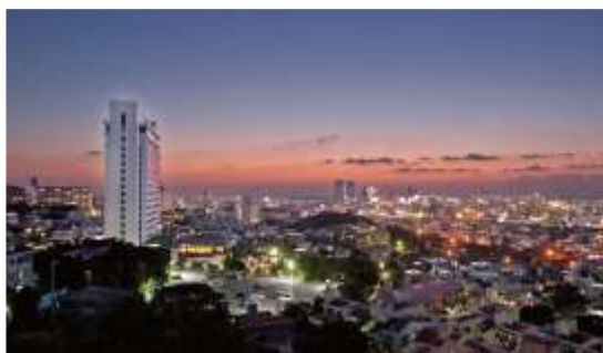
Hotel: Naha Shuri

Naha is the prefectural office of Okinawa, the capital of the former Ryukyu Kingdom. The site is now a world heritage in Okinawa, but there are also many tourist resources such as resort of southern country beach. Naha is a capital city of Okinawa, which is one of attractive prefecture in Japan. Double Tree by Hilton, Naha Shuri Castle, the place for the conference is located in the Naha City. It takes only 30 minutes from Naha International Airport. The transportation for coming to the Hotel is recommended by taxi from Monorail Stations.